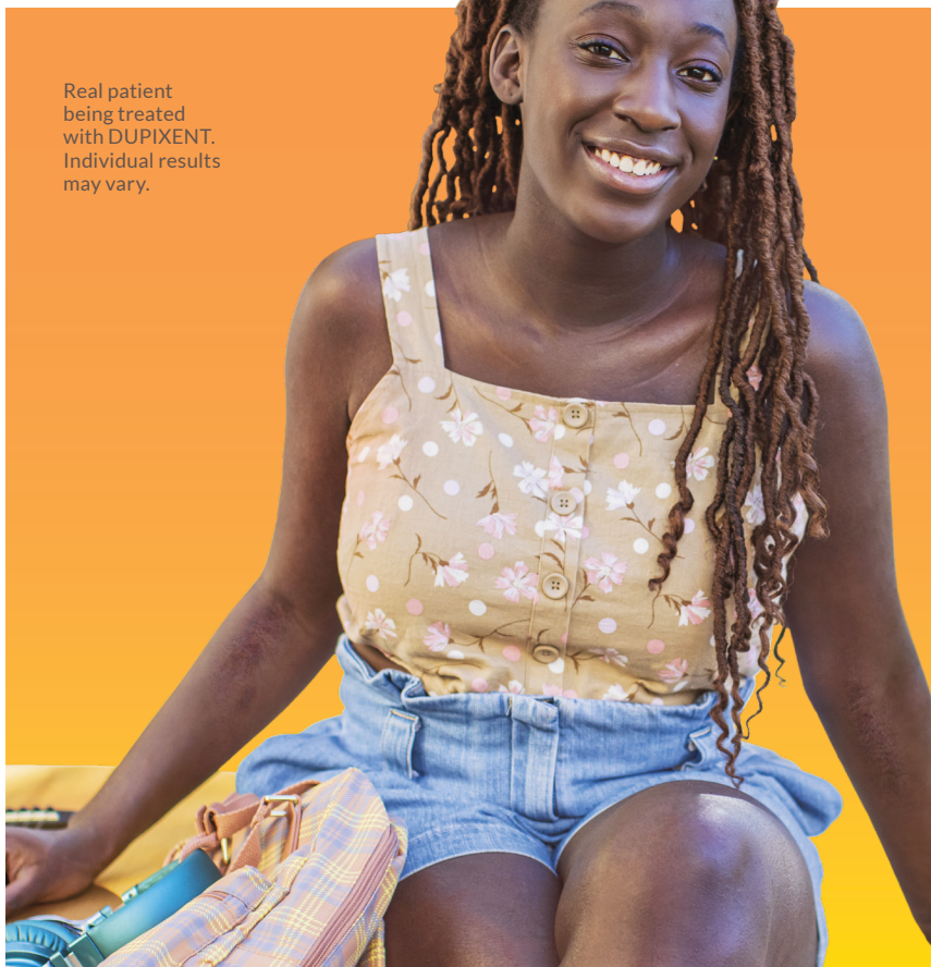
Real patient being treated with DUPIXENT. Individual results may vary.