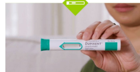
PRE-FILLED PEN →